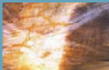
Category I Collagen