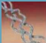
Category III Collagen Stimulation

The Erbium YAG laser transforms old, saggy Category III collagen back to firm and tighter Category I collagen. This naturally lifts and tightens the tissue, reversing the signs of aging in most cases. Treatment is comprised of 3-4 painless visits. The Erbium YAG laser also stimulates new collagen to form, preserving the results.